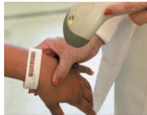
Using bar code scanners and the patient's bar coded wristband, the eMAR system checks the identity of the patient and medication at the time a drug is being administered.

Dupuis explained that upon admission to Parkland Medical Center, each patient will receive a special bar coded armband that a nurse will scan whenever medication is administered. The bar code corresponds to the patient's current drug history. The hospital pharmacy bar codes each dosage of medication required for every